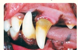
Photo of gum disease in an adult dog. Note the build up of yellow calculus.